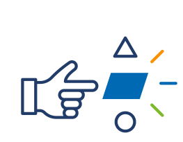
The freedom of independent work with ample scope for creativity and decision-making