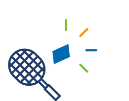
Wide range of health and sports activities

Please note: application costs (including travel expenses) cannot be covered.