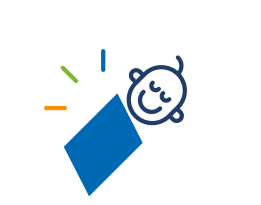
Family-friendly, flexible working environment